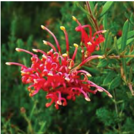
Grevillea juniperina ‘red’