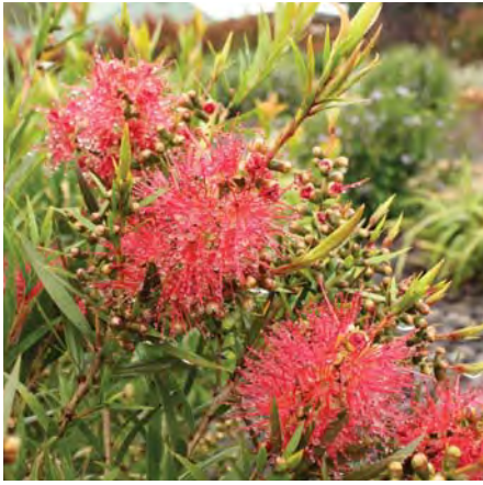
Callistemon ‘Scarlet Flame’