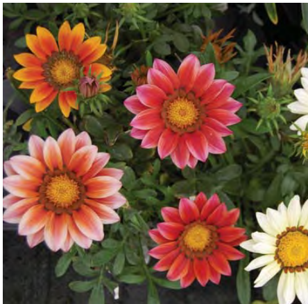
Gazania x hybrida