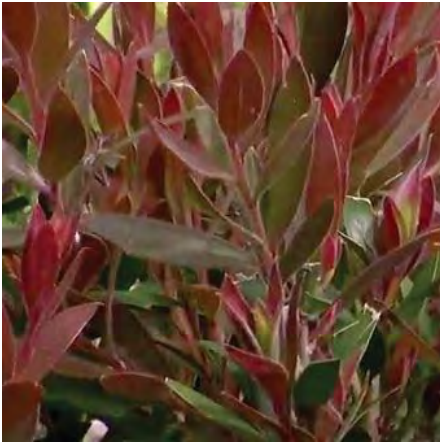
Callistemon ‘Red Alert’