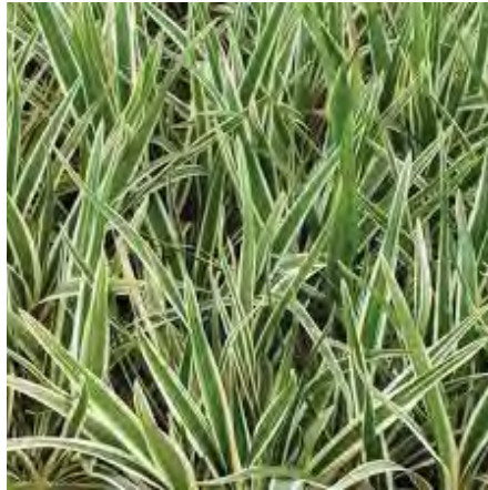
Dianella ‘Silver Streak’